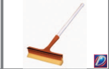
1080.24 LAVAVETRO CON MANICO WINDOW CLEANER WITH HANDLE