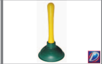
9400.72 STURALAVELLO PLASTIC SINK PLUNGER