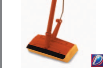
1100.12 LAVAPAVIMENTO CON GOMMA FLOOR SPONGE MOP WITH RUBBER