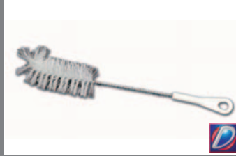
1040.100 LAVABIBERON BIBERON BRUSH