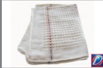
9000.250 PANNO COTONE CM 70X45 COTTON FLOOR CLOTH CM 70X45