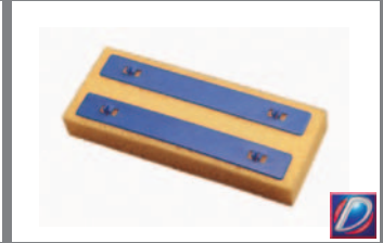
1110.6 RICAMBIO SPUGNA SPONGE REFILL IN POLYBAG