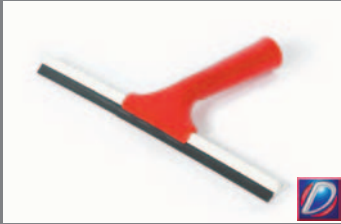
1140.24 LAVAVETRO PROFESSIONAL WINDOW CLEANER PROFESSIONAL