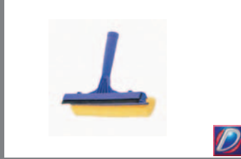
1070.24 LAVAVETRO WINDOW CLEANER