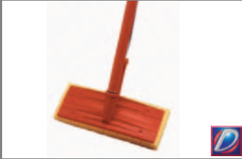
1090.12 LAVAPAVIMENTO FLOOR SPONGE MOP