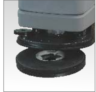
Brushes can be changed quickly without the need for any tools at the push of a button.