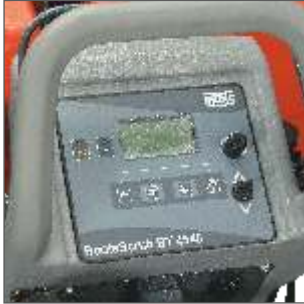
Ergonomic handle for operators of any height. Excellent view of the area to be cleaned. Soft touch buttons for selection of operation. LCD panel with display of hour meter, battery level.