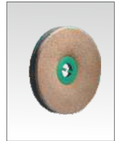
Pad holder available as option