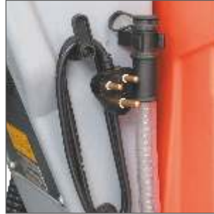
Comes with onboard charger as standard. Can be charged at any available plug socket.