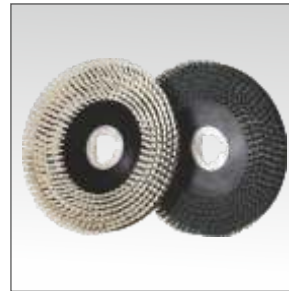
Variety of brushes to suit different applications.