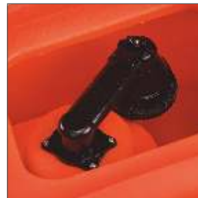
Easy tank cleaning, thanks to the large tank opening. Tank can be emptied quickly and easily via the large outlet hose. Overflow protection for the dirty water tank.