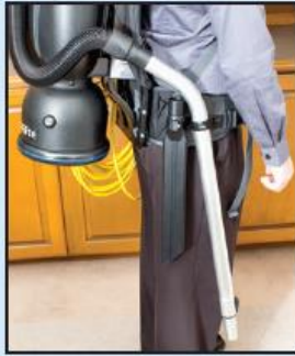
"Hands Free" system allows storing of the tools, including the wand, right on the belt for user convenience.