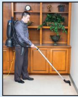
Perfect for cleaning carpet, hard floors and above floor cleaning.