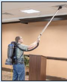
Aluminum telescoping wand allows easy access to a wide variety of areas.