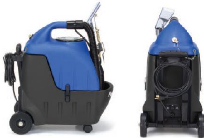
Sturdy aluminum telescoping handle for transport.

Powr-Flite COMMERCIAL FLOOR CARE EQUIPMENT