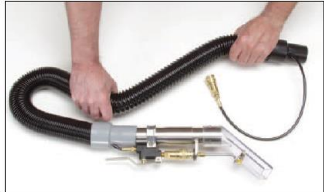
Stretch 2.5' to 10' insider vacuum and solution hose.